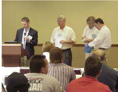
Pipeline Safety Staff conducts Seminar

The Commission held its annual Pipeline Safety Seminar at the Macon Holiday Inn Conference Center April 21-24 with about 350 people, primarily employees from municipal, private and master meter gas operators from around the state, in attendance. Pipeline Safety staff made presentations on the federal pipeline safety regulations and state GUFPA law. Special breakout sessions were held for the attendees to sharpen their technical skills in performing certain tasks on the pipelines. Vendors were present to introduce the latest tech-