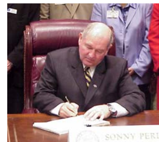
Governor Perdue signs SB 272

Governor Sonny Perdue signed Senate Bill 272 June 4 to enable Georgia residents to include their wireless and mobile phone numbers on the Georgia No Call List. The Commission proposed this consumer-oriented legislation that unanimously passed the 2003 Georgia General Assembly. Senator Mitch Seabaugh (R-