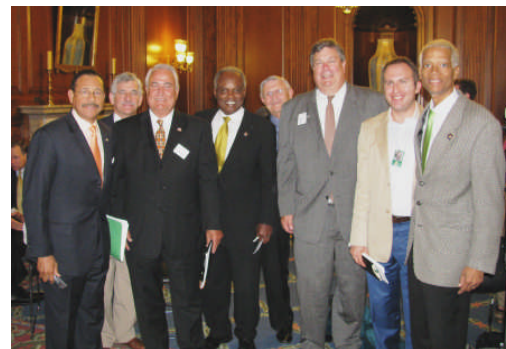
Representatives Sanford Bishop, David Scott and Hank Johnson with Commissioners