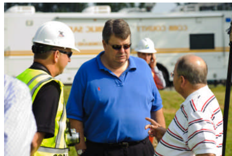
AGL officials brief Commissioner Wise on the safety drill

got an up close and personal look at a natural gas pipeline explosion safety drill on May 11, 2011 in Cobb County. Atlanta Gas Light Company teamed up with Cobb County and Kennesaw city officials to sponsor the training evolution.