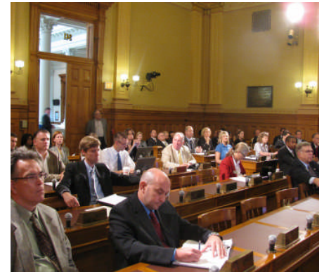
Audience fills the room during the Forum