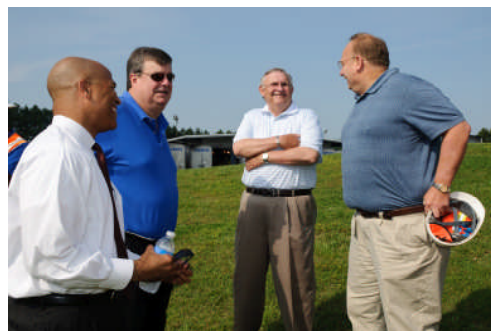
Commissioners Wise and Everett discuss the safety drill

Commissioner Wise said the "call before you dig laws have made a difference in the num-