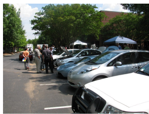
Alternative Fueled Vehicles line up outside Suniva Solar in Norcross