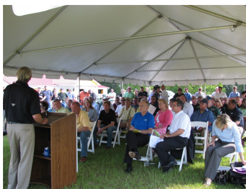
The AFV Roadshow under the tent near Thomasville at the state line

fueled vehicles and provide natives to traditional gasoline and tive fuel research, development