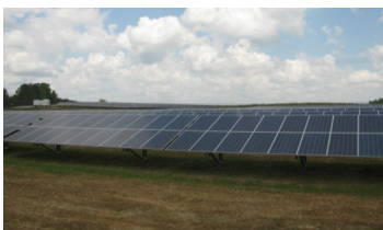
Solar panels at the Silicon Ranch in Social Circle, Georgia

built the solar farm and will provide ongoing operations and maintenance support.