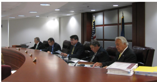
Commissioners Listen to Testimony during the hearing