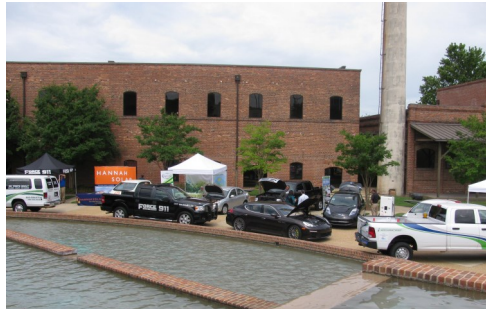
Alternative Fueled Vehicles on display at the Columbus Trade and Convention Center