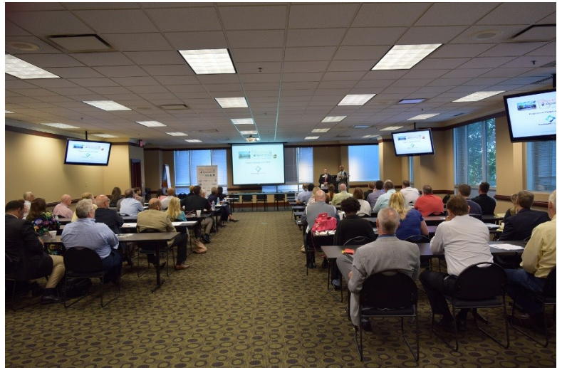
Gwinnett Chamber of Commerce, July 17