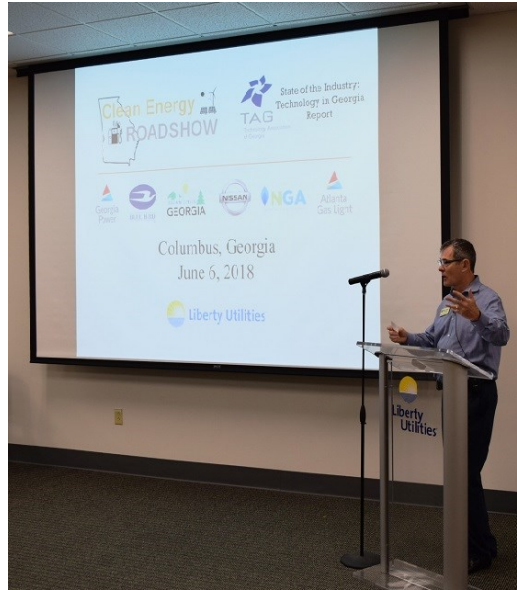
Columbus, Georgia June 6

The 2018 Clean Energy Roadshow featured a unique partnership