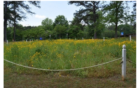
Completed pollination project at The Ray rest stop on I-85

On August 21, the Commission approved a pilot solar project that will use Georgia Department of Transportation (GDOT) right of way to finalize a one megawatt project at Exit 14 along Interstate 85 at the U.S. Highway 27 interchange. This pilot is a partnership with GDOT, The Ray and Georgia Power that will provide general benefits to the state and the consumers of Georgia Power.