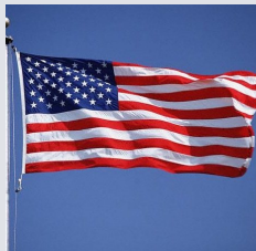
Flag Day Thursday, June 14th