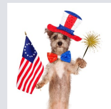
Wednesday, July 4th