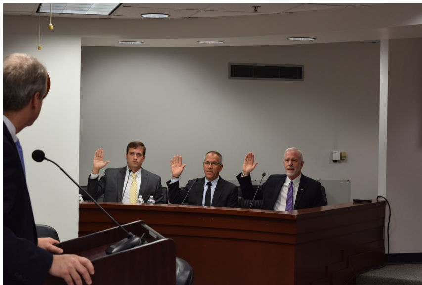
Georgia Power witness panel takes the stand to present their testimony.