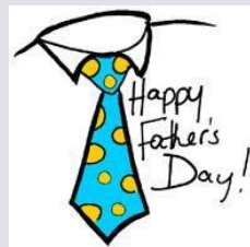
Sunday, June 17th