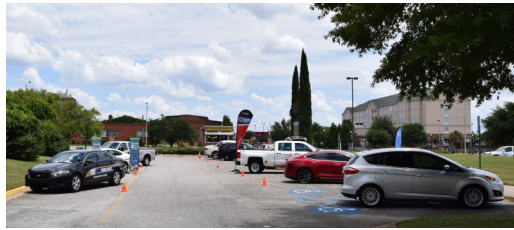
Showcase of Vehicles in Albany, Georgia