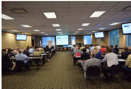
Guinnett Road Show Presentation