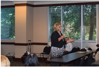
State Senator Renee Unterman speaks to the Clean Energy Roadshow in Duluth