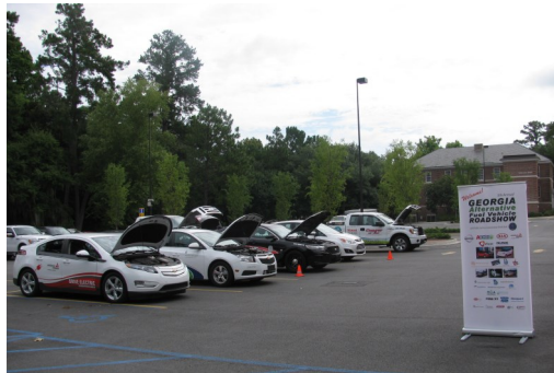
Alternative Vehicles line up outside Valdosta State University

The tour began June 15 in Gainesville, then traveled to Cartersville and Albany before closing out the first week in College Park at the Georgia International Convention Center. The tour opened its second week on