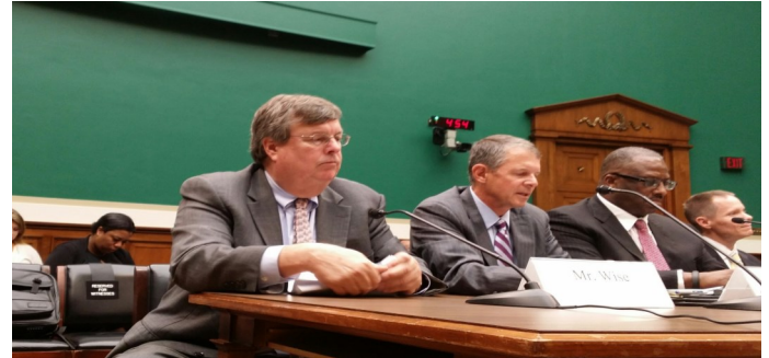
Commissioner Stan Wise sits next to other witnesses appearing before the House Subcommittee on Energy and Power on July 14

C ommissioner Stan Wise testified before Congress on July 14 on the progress that the Pipeline and Hazardous Materials Safety Administration, (PHMSA) is making in implementing a 2011 law on pipeline safety standards. Wise appeared before the U.S. House Subcommittee on Energy and Power. Commissioner Wise appeared on behalf of the National Association of Regulatory Utility Commissioners (NARUC) and the Commission. In his testimony, Wise outlined several proposed amendments to the Act to streamline pipeline safety enforcement by state regulators and reduce administrative and bureau-