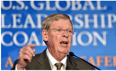
U.S. Senator Johnny Isakson speaks to the USGLC meeting here