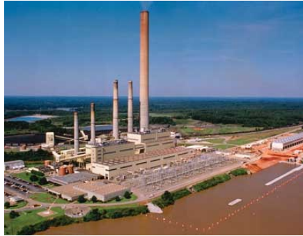
Georgia Power Plant Branch, Milledgeville, Georgia

The Commission March 20 by a 4-1 vote approved Georgia Power's request to remove from service, two coal fired electric generation plants at Plant Branch in Putnam County, Georgia and one oil fired generation unit at Plant Mitchell in Mitchell County in southwest Georgia.