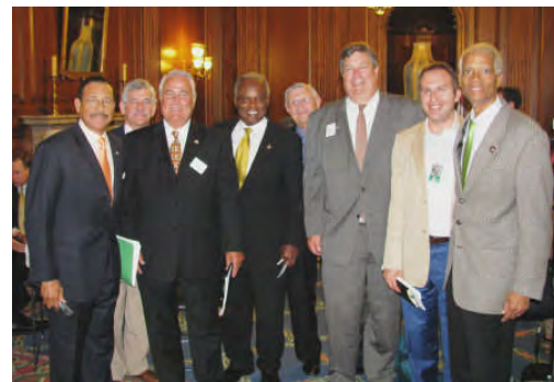
Representatives Sanford Bishop, David Scott and Hank Johnson with Commissioners