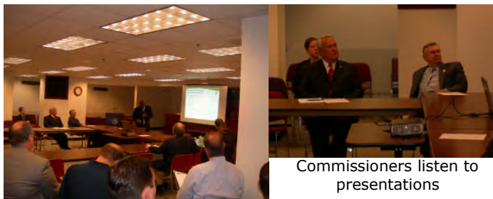
Commissioners listen to presentations

The Commission held a two-day workshop March 30 and March 31 to hear from utilities, telecommunications providers, state agencies and other interested parties on how the American Recovery and Reinvestment Act (ARRA) of 2009 affects regulators, regulated companies and