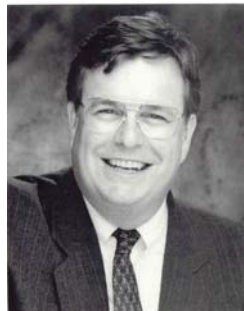
Commissioner Stan Wise

pected to attend. The NARUC Convention will pump about $1