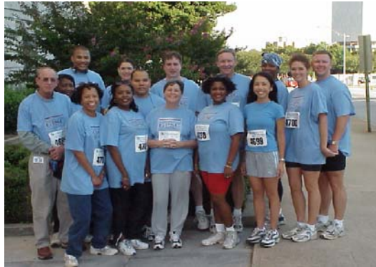
The "Regulators" gather before race time

For the third consecutive year, the Commission was represented well by a courageous group of competitors at the PROMINA Corporate Run/Walk. The event promotes fitness and fellowship among employees of metro area business organizations and raises money to help support the Atlanta Braves Foundation and the Boys & Girls Clubs of Metro Atlanta. It provides an excellent opportunity for colleagues and friends to encourage and compete with