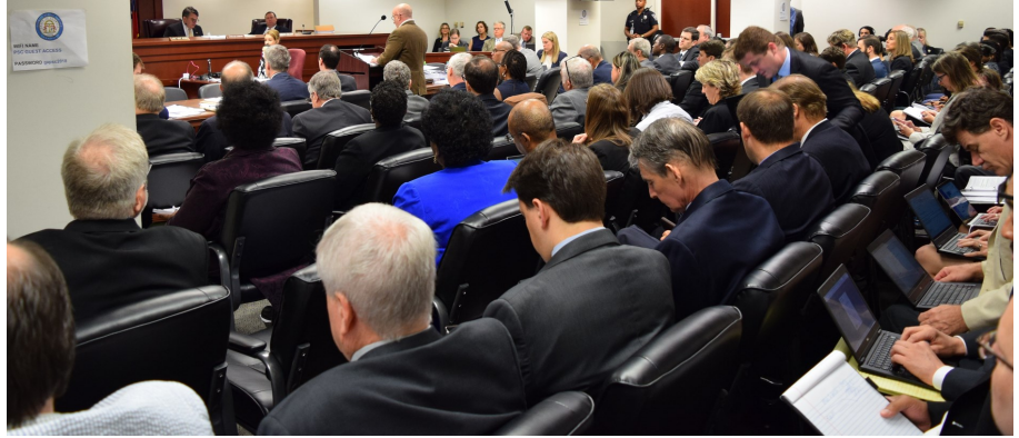
April hearing in the first-floor hearing room where every seat was occupied