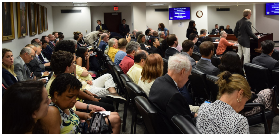
July hearing where audience members stood along the walls of the room