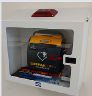
Automated External Defibrillator — 2nd Floor

Two of such defibrillators are located within our offices. One is in the 2nd floor mail room. Another is in the break-room on the 1st floor of the 254 building.