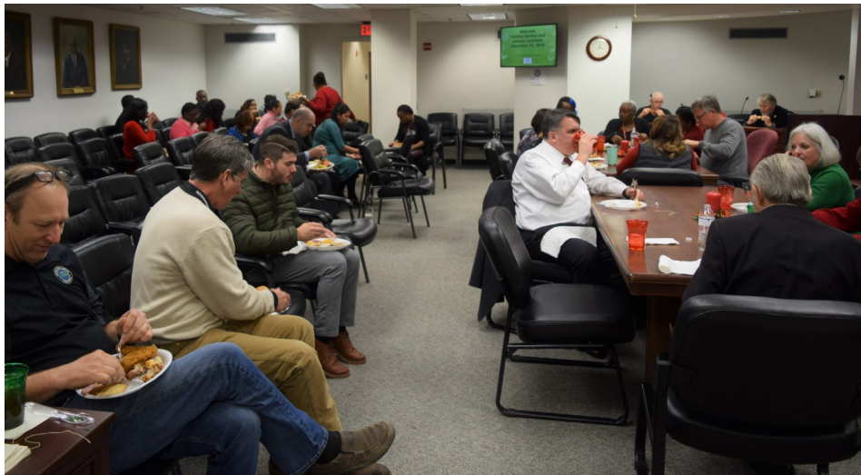
Everyone enjoyed a wonderful meal following the Faithful Service Award Presentations