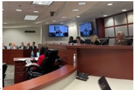
Commissioners listen to information from staff and Atlanta Gas Light experts on the Integrated Capacity and Delivery Plan.

In 2019, the Commission saw the need for better long-term planning. Commissioners authorized staff and Atlanta Gas Light to explore a 10-year plan that would be reviewed and updated by the Commission every three years. In October, the Commission approved the first plan. Commissioners hope this will allow the PSC to have better oversight into capacity issues as well as rate issues for natural gas in the coming years.