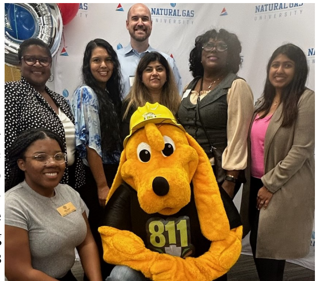
PSC staffers pose with Digger the 811 Dog.

The recent Expo included representatives from a number of Atlanta Gas Light departments including Technology Operations, Regulatory Affairs, Customer Service, Customer Relations, Marketing, Corporate Communication, Growth and Retention, Operations and Damage Prevention. Also in attendance were Certificated Marketers, representatives with HOPE WORKS and Georgia 811 — with a special appearance by Digger the Dog.