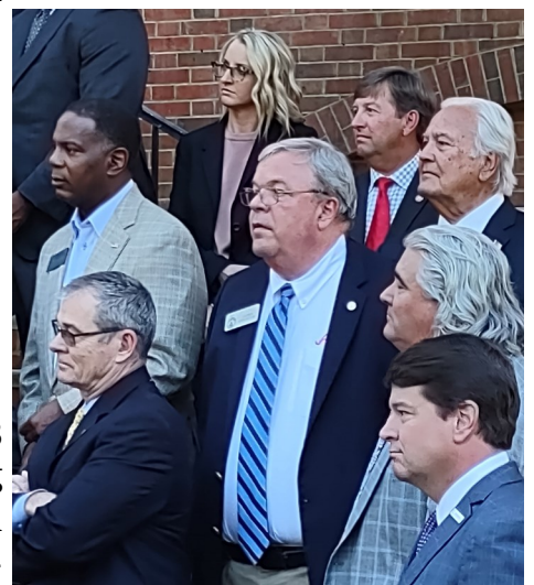
Commissioners Fitz Johnson , Lauren “Bubba” McDonald Jr. and Tim Echols listen in as the Governor makes the historic announcement.

Area Development magazine’s 2023 rankings of the “Top States for Doing Business” are based on scores from approximately 50 leading site consulting firms in 14 categories. Georgia placed in the top 10 for all 14 categories, earning the No. 1 spot in seven classifications and claiming the overall No. 1 ranking.