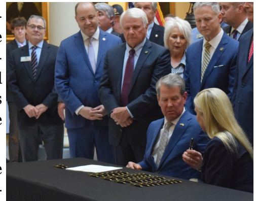
Gov. Brian Kemp signs the FY2026 state budget

"Here in Georgia, we're keeping government in check, cutting taxes, and returning taxpayer money where it belongs — back to hardworking Georgians," Kemp said. "We balance our budgets and encourage economic growth statewide without growing government."