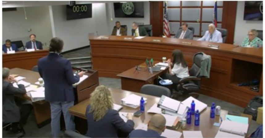
Commissioners listen to cross examination of staff witnesses

The Commissioners are set to vote on the IRP at the July 15 Administrative Session.